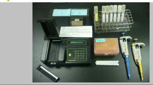
Figure 1. The novel system Machine of PAHs (naphthalene) detection.

(The PAHs biodetection system (gst-lux))